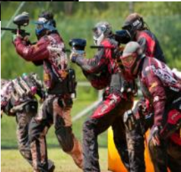
Building on Friendships