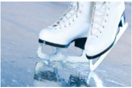
Learning Outside of the Classroom