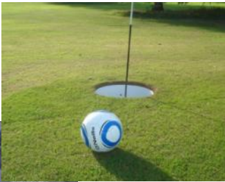
Fun and Laughter